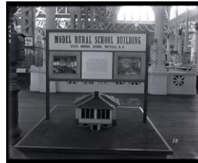
Panama-Pacific International Exposition, 1915; Smithsonian Institution Archives; CCO; https://www.si.edu/object/panama-pacific-international-exposition-1915%3Asiris_arc_390643

507 $a Scale: 1/5"=1'-0", 1 : 60 of the original building